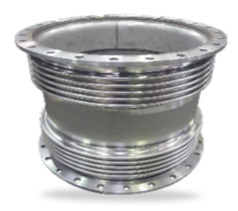
US type for exhaust outlet

After more than 150 metal expansion joints have been used for scrubber applications, Alborzi offers a positive summary: "Despite the challenging requirements the metal expansion joints run very reliable and there haven't been any failures up to now. We're proud to contribute our share to more sustainability within the shipping industry with our technology and our products."