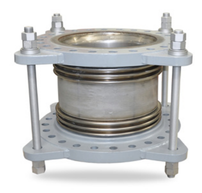
UN type for wash water inlet and outlet